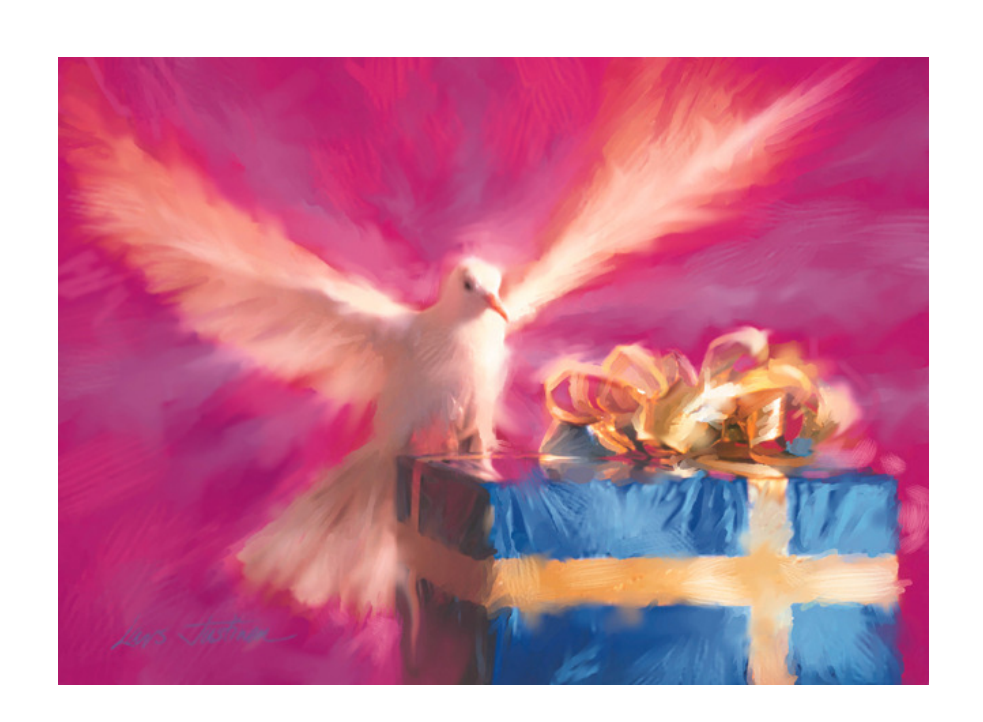
Spiritual Gifts: What are they? Everything God does Fulfills a Need or Meets a Purpose